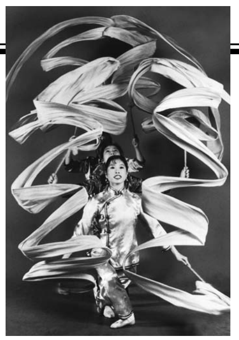
Silk ribbons used for dancing go back to the Han Dynasty. At that time, musicians and dancers were employed in wealthy households.

The Chinese Republic overthrow the Qing dynasty and adopted the Western Gregorian calender. 37 years later, it was destroyed by wars with Japan and civil war with the Communists. Since 1949, the Republican government withdrew to Taiwan, while the Communist set up the present day People's Republic of China. Hong Kong returned to China after 99 years of British rule in 1997.